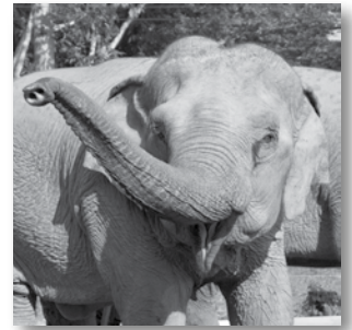
The Elephant in the Room

There's a pachyderm in the room, and her name is Corona ( actually, her name is Wassana, and I'm borrowing her beautiful face for this bit ). Like so many nonprofits, small businesses, and arts organizations, AOKC was hit hard by COVID-19.