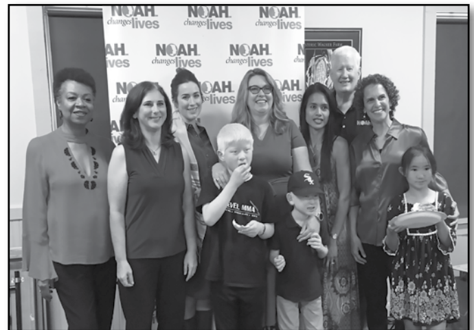
AOKC-ers join the folks from NOAH after a farm performance of 'You Can't Be Serious!'

performance for NOAH. It was a unique event for AOKC. The venue was Wagner Farm in Glenview. AOKC kicked off the afternoon with a show, then the kids and their families went on hay rides, enjoyed lunch, took tours, and explored the historic farm on their own. Cabaret and hay rides may not be a typical combination, but it turned out to be a winning one!